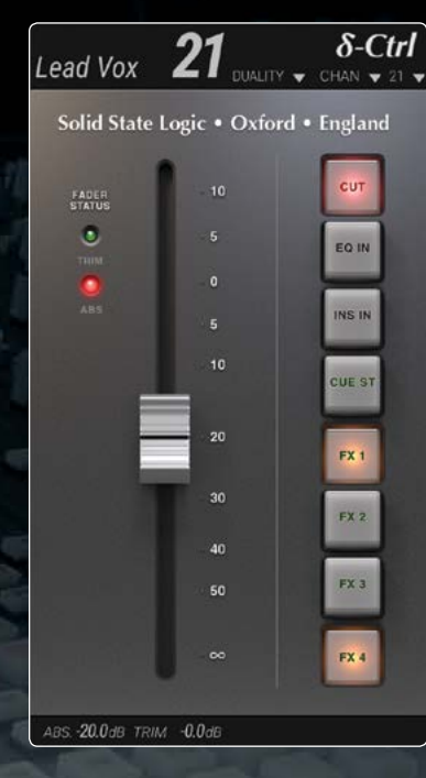
The \delta elta Ctrl plug-in

Automation data can be viewed and edited as normal plug-in data in the DAW tracks. The Duality Fader Absolute and Trim values are saved using the same dB law as Pro Tools Fader automation so that the 'Paste Special' command can be used to copy existing Pro Tools fader data into the plug-in. This feature is DAW specific and may not necessarily be available with other systems. \delta -Ctrl retains all the key operational elements of SSL's Signature Mix System with much loved features such as JOIN, REVISE, MOTORS OFF and SNAP Override all actioned from dedicated front panel switches. The MOTORS OFF mode offers the full non moving fader SSL VCA mix experience as preferred by key industry re-mixers. The New MOTORS OFF, Touch Write mode emulates the SSL G Series Mix system Immediate Pickup (IP) option. \delta -Ctrl also works with SSL AWS \delta elta consoles.